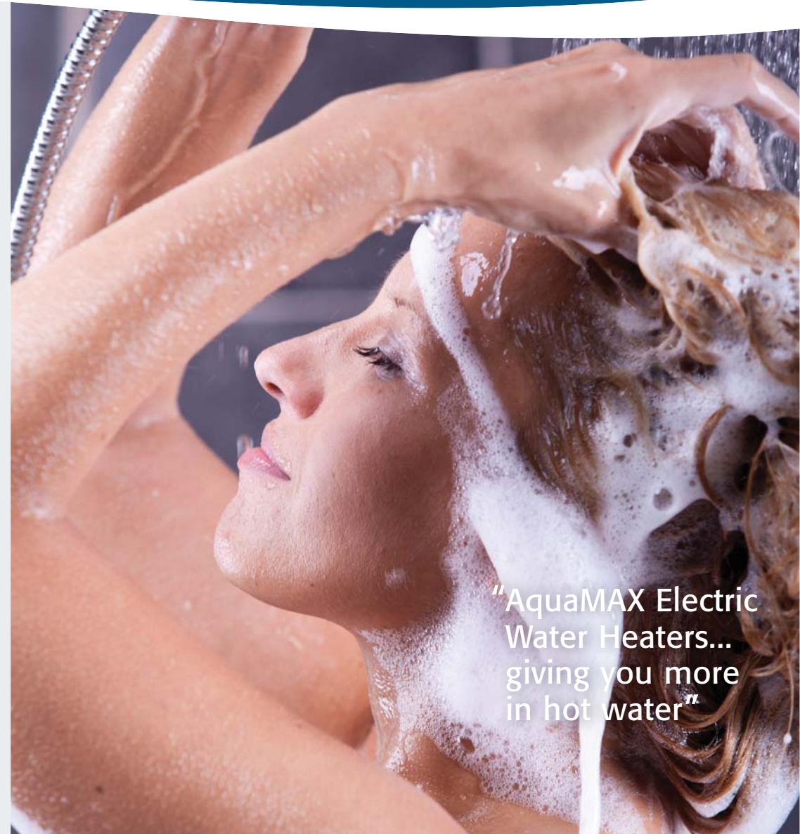
ELECTRIC STORAGE WATER HEATER

"AquaMAX Electric Water Heaters... giving you more in hot water"